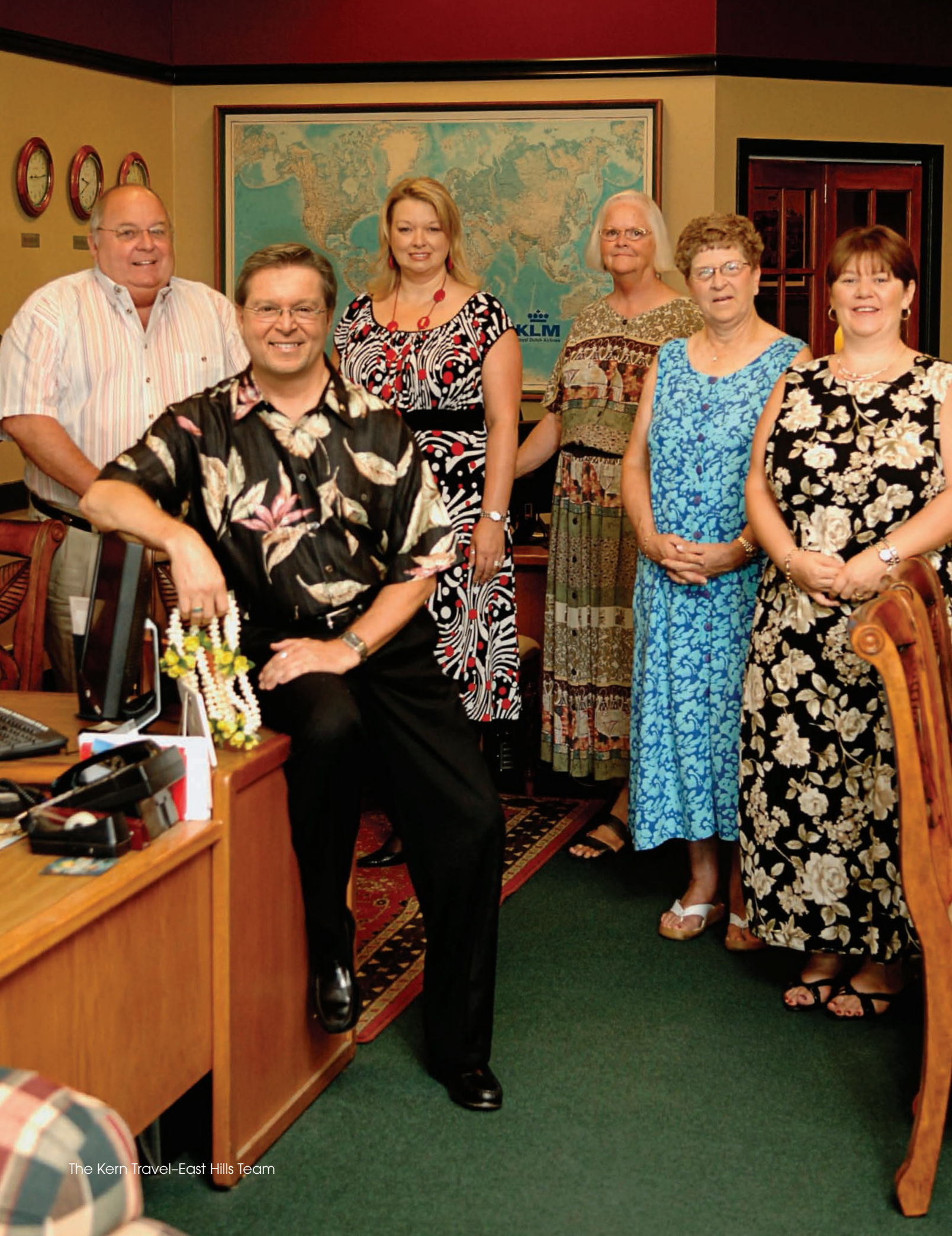
The Kern Travel-East Hills Team